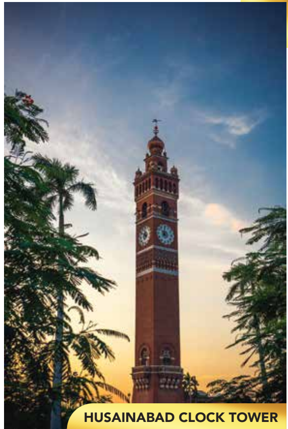
HUSAINABAD CLOCK TOWER