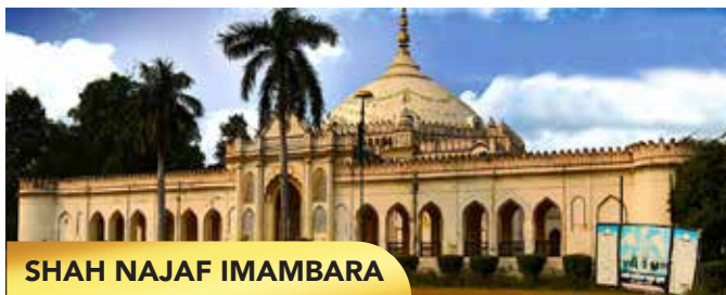
SHAH NAJAF IMAMBARA