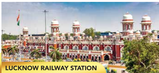
LUCKNOW RAILWAY STATION